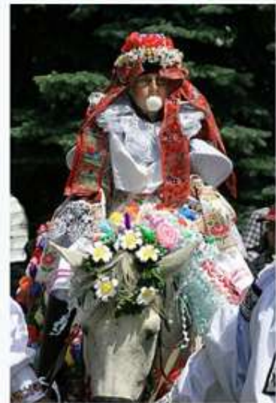
A young boy (the "King") in traditional costume with a rose in his mouth at the Ride of Kings in Vlčnov (2007)