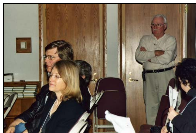
Presentations and speakers were very good.

Feedback received by symposium organizers relative to the overall symposium has been very positive and more importantly, a good time was had by all!