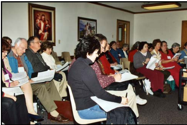
The speaker has their undivided attention.